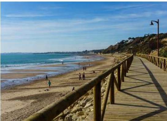
Santa Catalina Beach